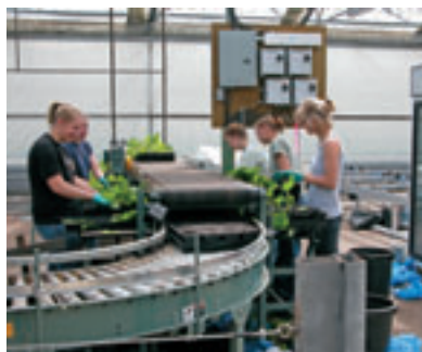
Van Belle Nursery mapped and timed every process before implementing Lean manufacturing techniques.