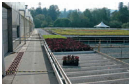
Plants are easily moved in and out of the Cravo houses with roll-up sides.

Flats go through a flat filler and a watering tunnel. Next the flats are dibbled, travel through the conveyor to awaiting employees who remove the trays and stick them. Next the trays